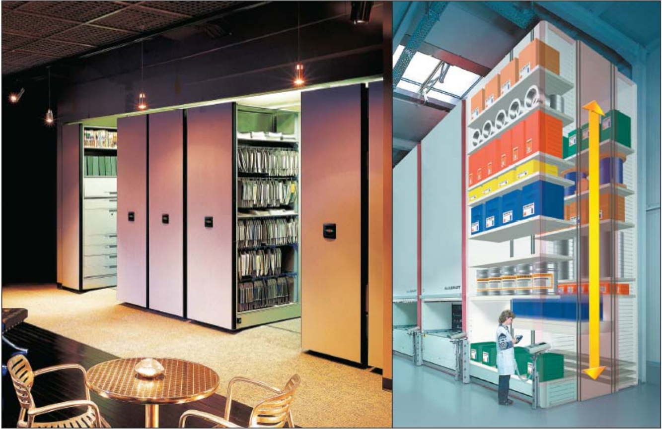
Whatever you need to store and retrieve, from airplane parts to priceless artwork, Spacesaver Systems will help you find a better way to do it.